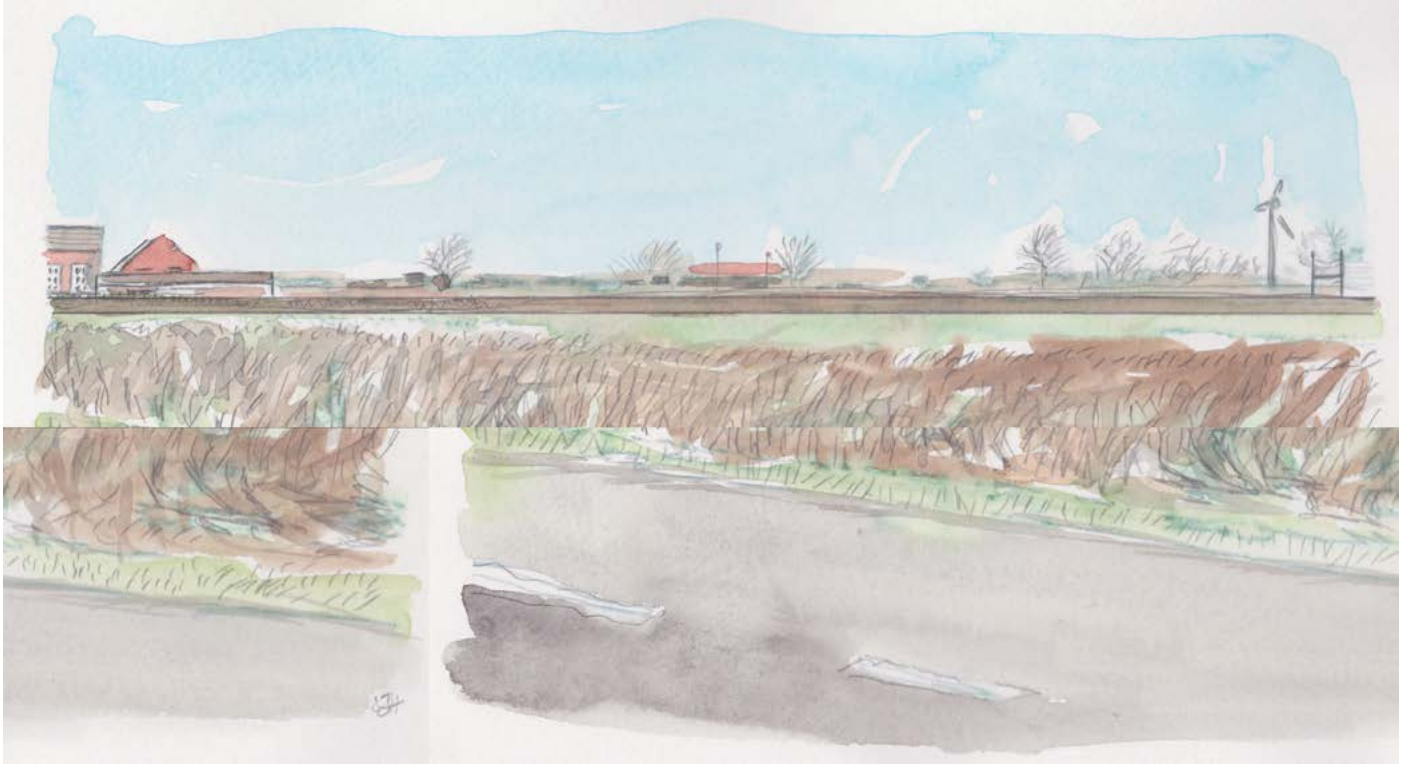
Illustration 3 - UCC Small Turbine

For the period 1.11.20 - 31.10.21 UCC electricity consumption was:-