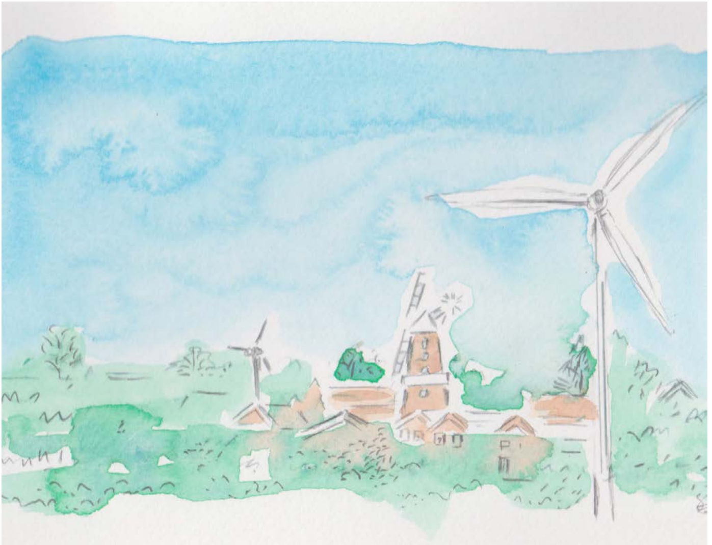
Illustration 2 – Heritage windmill and small turbine comparison

The scale and visual impact of turbines with the choices available was debated. With regard to scale, an illustrative turbine drawing based on the windmill at Whissendine is below.