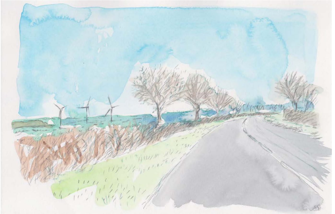
Illustration 5 – Three medium turbines on the Rutland plateau