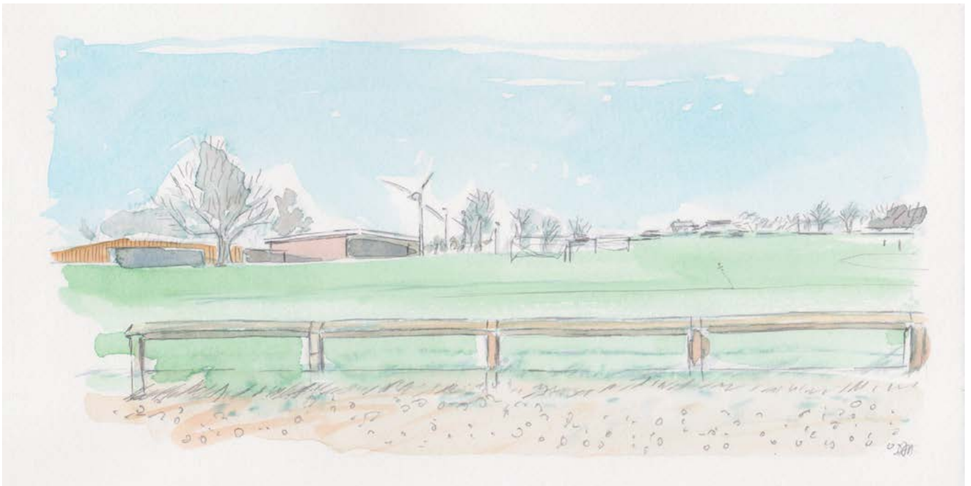
Illustration 4 – Uppingham School Small Turbine